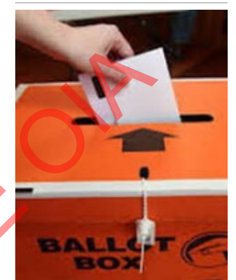
The election period has begun, so learn your rights and what to be aware of.