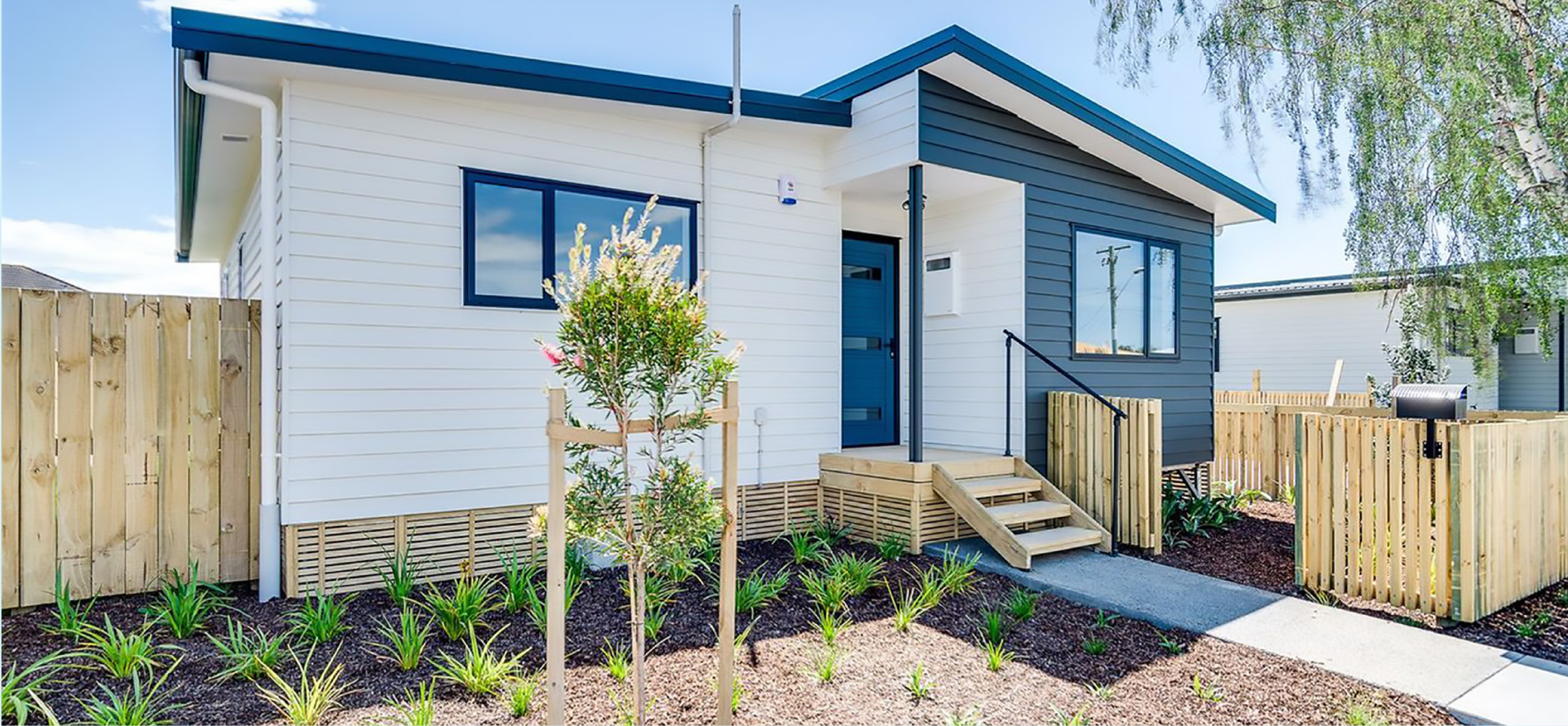
Image: Geddis Ave – KiwiBuild houses in Napier – build by Kāinga Ora.