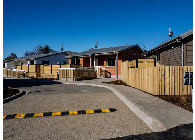
This long driveway has been made safer with speed bumps and a separate pathway for pedestrians.