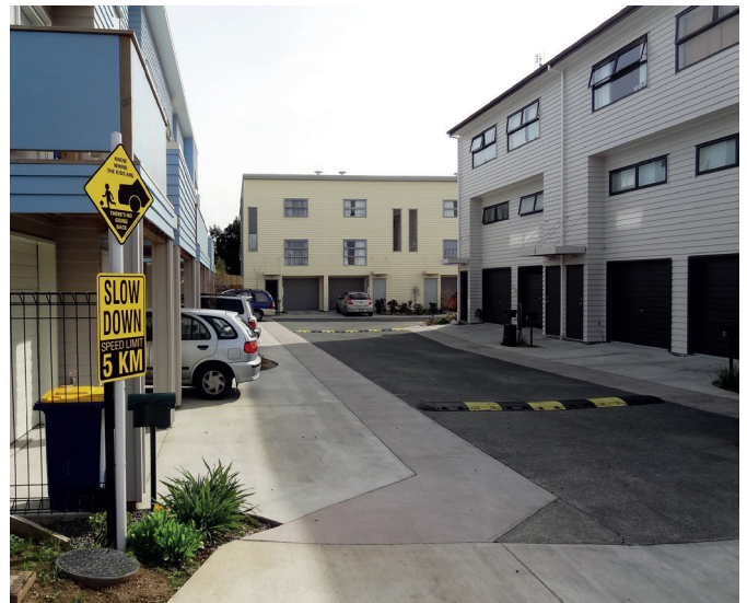
Speed signs and speed bumps like this may also be installed at some complexes.